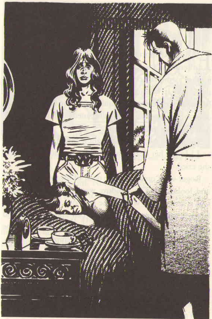
'She's dead,' Roger said slowly. 'Mother is dead!'

'Family! Nobody loved Mother!' Diane went out and ran downstairs.