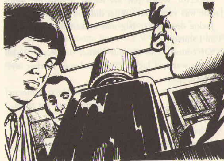
'We found the empty bottle of sleeping tablets in Diane's room.'

'Yes. My mother usually took a sleeping tablet every night so she needed a lot of tablets. Sometimes she got